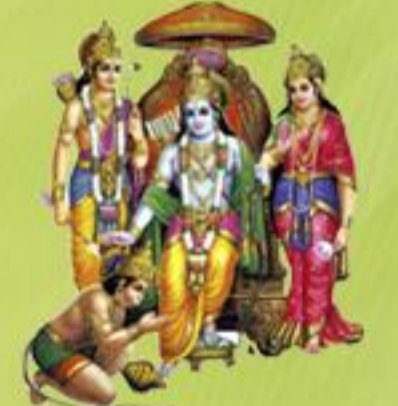
Sree Ramar Temple

Refulgence is not just a software solutions company. It's a 'Total IT Solutions' spot. What more? Place your order and leave it to us. We will provide the complete Hardware, Networking, Software and all accessories to you with support.