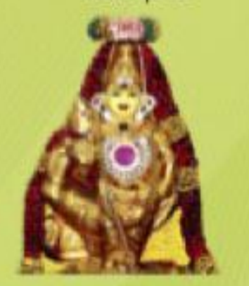
Holy Tree Sri Balasubramaniyar Temple