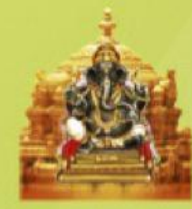
Sri Senpaga Vinayagar Temple