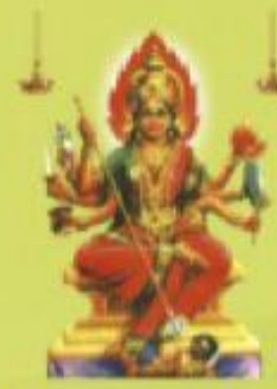
Sri Veeramakaliamman Temple