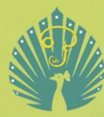
Sri Layan Sithi Vinayagar Temple