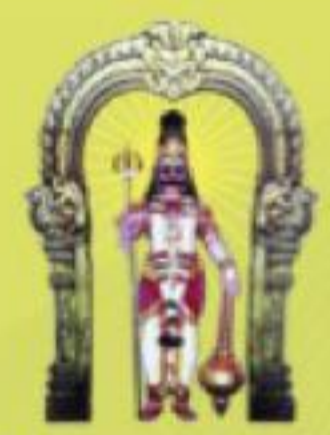
Sri Muneeswaran Temple