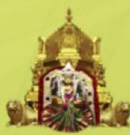
Sree Maha Mariamman Temple