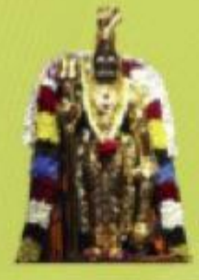
Sri Darma Muneeswaran Temple