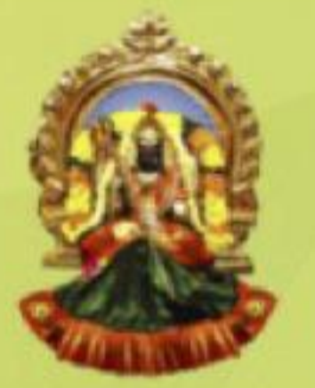
Sri Vadapathira Kaliamman Temple