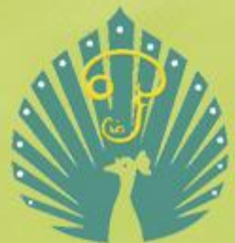
Sri Thendayuthapani Temple